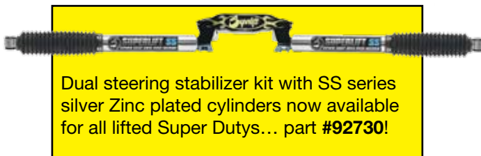
Dual steering stabilizer kit with SS series silver Zinc plated cylinders now available for all lifted Super Dutys... part #92730!

Note that factory steering stabilizer cannot be retained. Choose from two different dual stabilizer options.